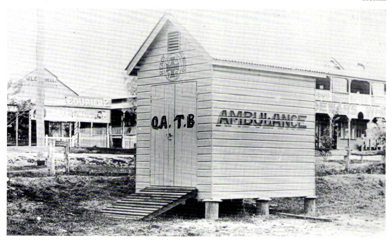
Toogoolawah Ambulance. 1920s.