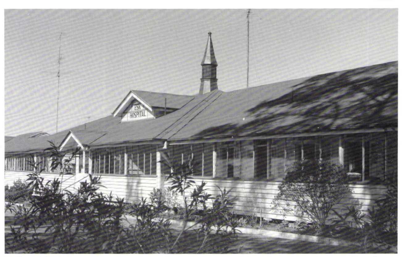
Esk Hospital. 1987.

mile radius. As it had originally been a government dam, the Council always sought subsidies. In 1906 a new water reserve was set aside and two new wells were put down in 1907 — Varley's and Herman's. There was also Granzien's windmill on Mount Beppo road which Council controlled in dry weather; August Granzien became the first caretaker of the mill in 1914. The Mount Beppo dam served the district into the late 1950s when individual farmers began constructing their own farm dams. Further west at Ottaba the well put down in 1908 was used for travelling stock.