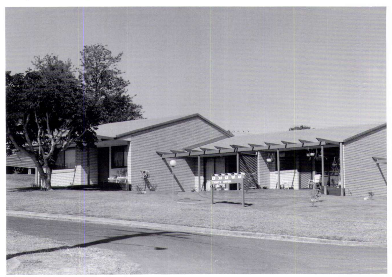
Lutheran Trinity Haven Retirement Home, Lowood. 1987.