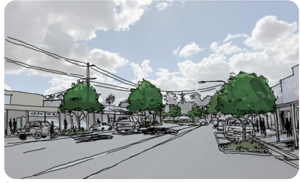
Street tree build out providing shade and greenery to the street