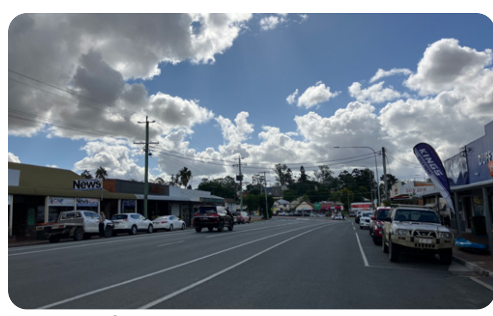
Existing Mary Street