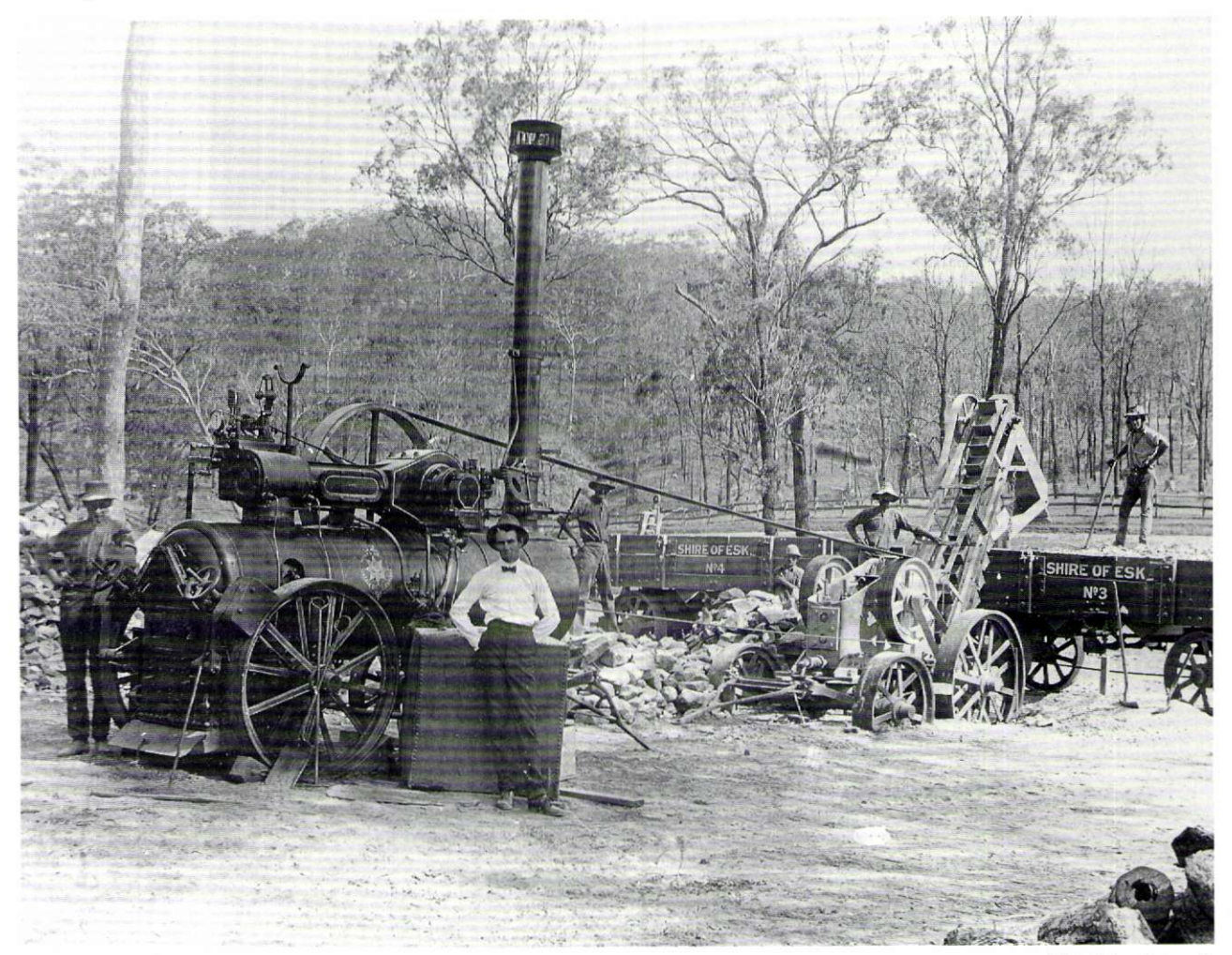
Engineer P.W. Hill in front of Esk Shire Council portable boiler and crushing plant. 1914.