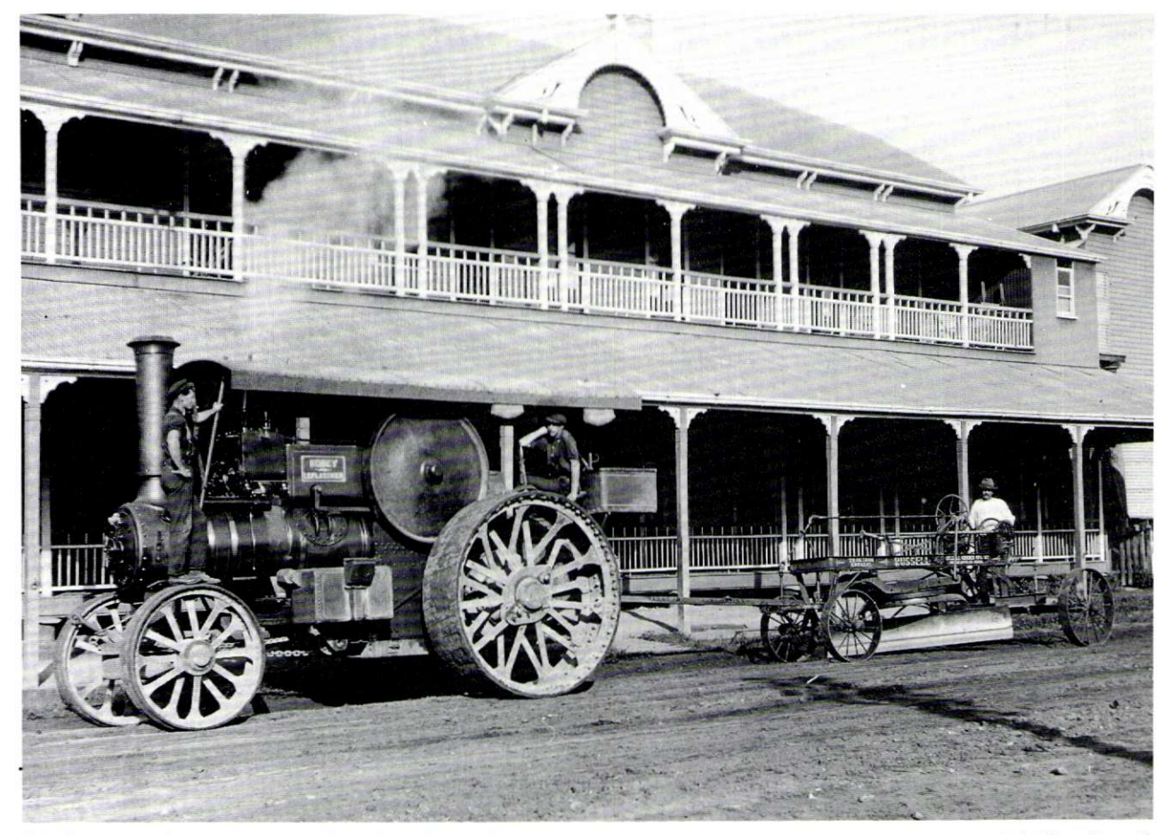
Esk Shire Council traction engine and grader in front of Metropole Hotel, Esk. 1914.