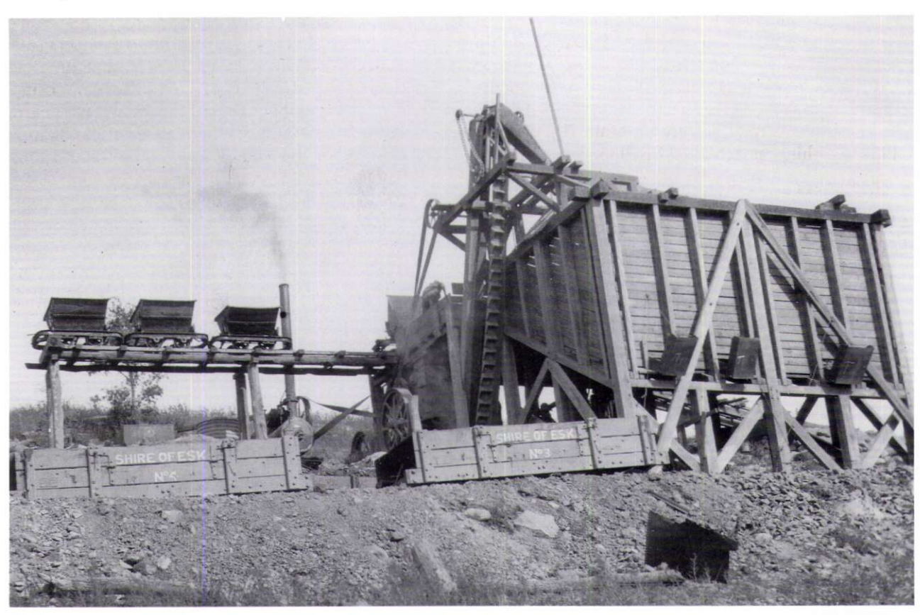
Lowood Quarry crushing plant. 1924.