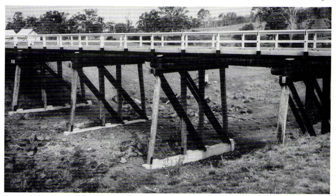
Bridge over Wallaby Creek on Brisbane Valley Highway. 1950s.