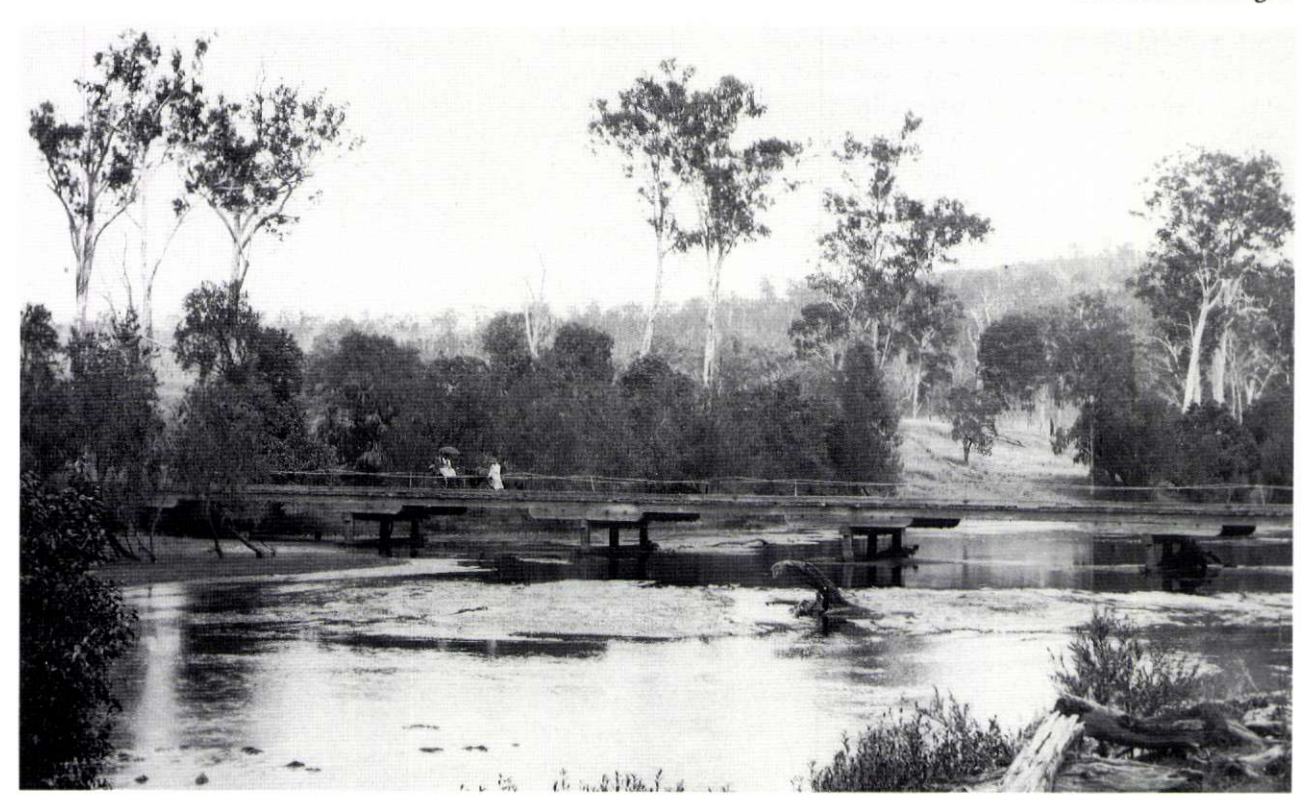
Northbrook Bridge over the Brisbane River. 1920s.