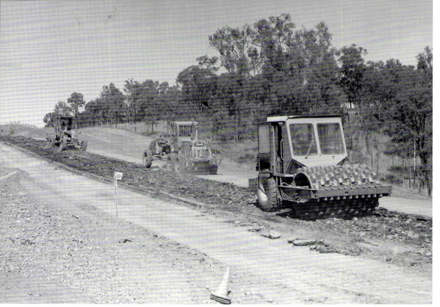
Road construction work on the Brisbane Valley Highway near Ottaba south of Toogoolawah. 1987.