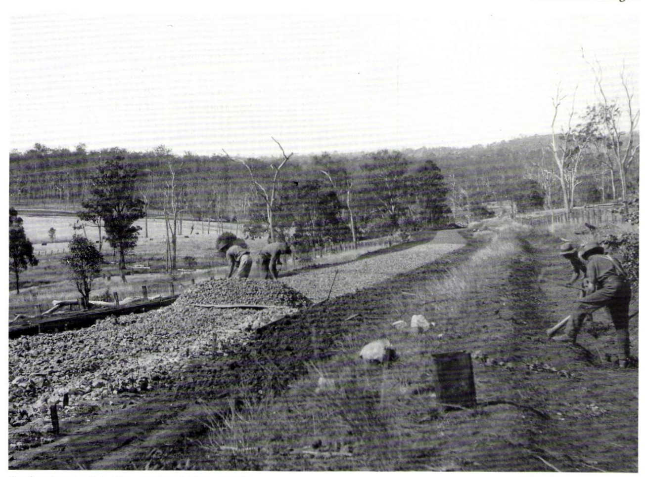
Roadworkers on Esk-Hampton Road, 29 April 1924.