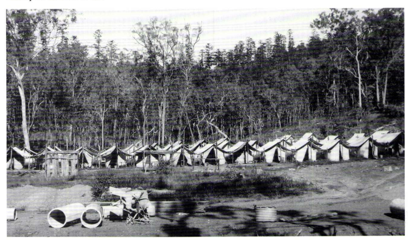
Construction workers' tents on Blackbutt Range. 1930s.