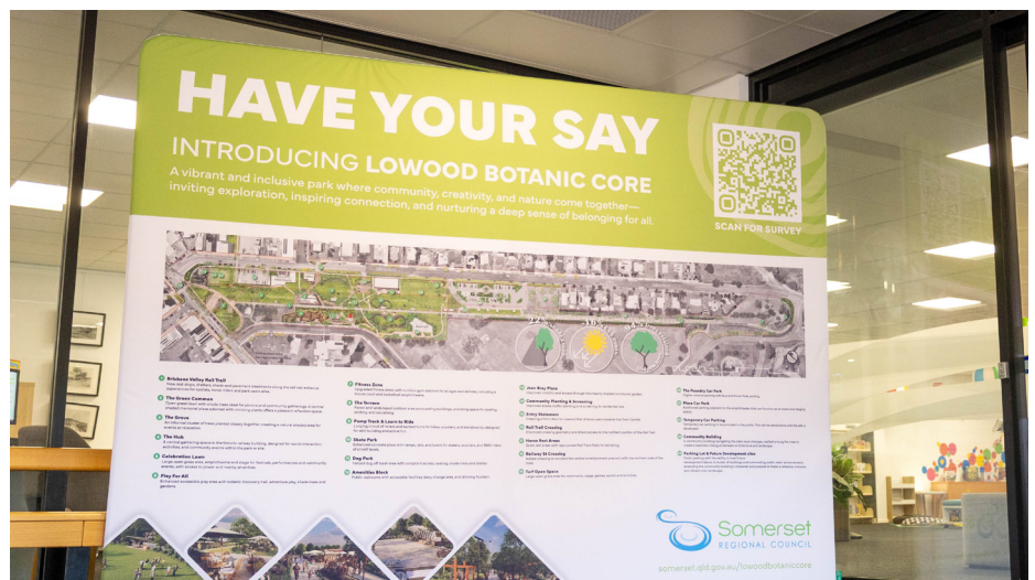
Council invited the community to review and discuss the Lowood Botanic Core plans at the Lowood Library

» 72% support reducing the speed limit in the main town streets